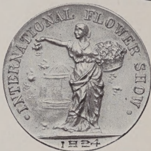
For Coronilla coronata 1924